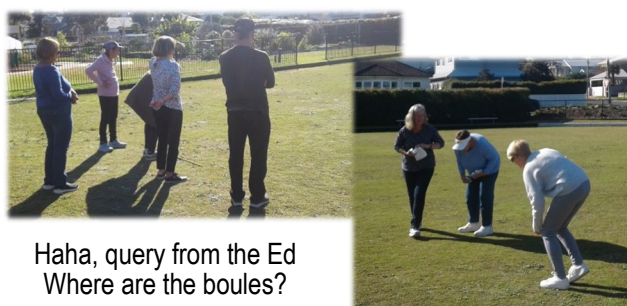
Haha, query from the Ed Where are the boules?