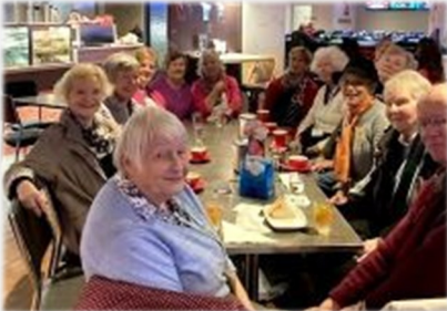
Lunch at The Juniors Kingsford Leagues Club