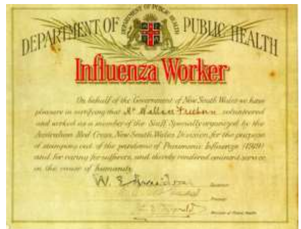
A Volunteer is acknowledged by the NSW Department of Public Health

For a time during the flu epidemic, it was compulsory to wear a mask in public and then as now, there were varying opinions as to the efficacy of such practice. Places of entertainment such as cinemas, theatres and dance halls were closed and for the first time, the Sydney Easter Show was cancelled. Churches were closed and Empire Day celebrations were impacted.