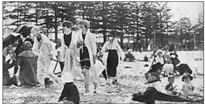
Manly Beach 1919

Windsor and Richmond Gazette, 7 Feb, 1919