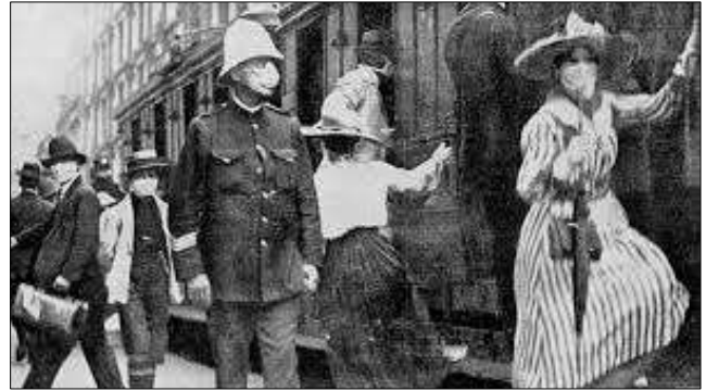
Wearing Masks in Public 1919 arc.parracity.nsw.gov.au

The greatest care and cleanliness should be practised during the influenza epidemic. Disinfectants should be liberally used, masks worn and crowding avoided. Keep away from Sydney.