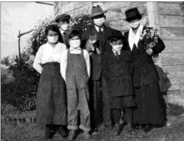
Masks on - even the family pet!

Windsor and Richmond Gazette, 7 Feb 1919